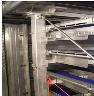
StepCool Multi-level Cooler