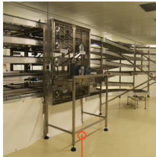
Central Drive System