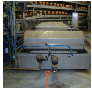
Ultrasonic Belt Washer