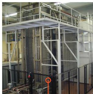
CapStep Storage and Retrieval