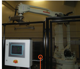
Control Panel Outside Safety Fence