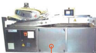
Bread & Roll 2000 Depanner