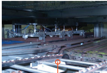
Grippers for Delidding