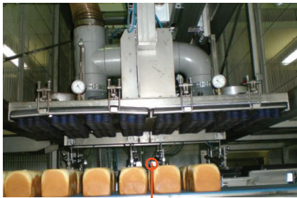
Vacuum Head for Depanning